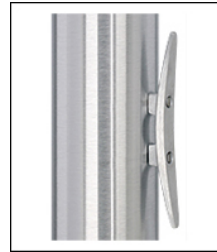
CLA-9090-SAT | 11' from bottom Cleat Only