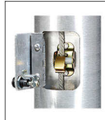
ICC - CAM CLEAT