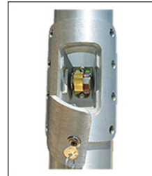
ISC - CAM CLEAT