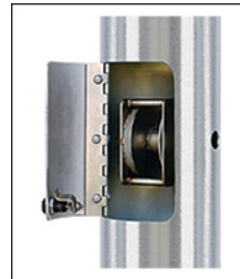
IWW - WINCH Flush Mount Hinged Door