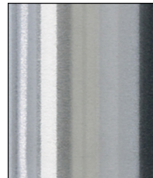
SAT Satin Finish