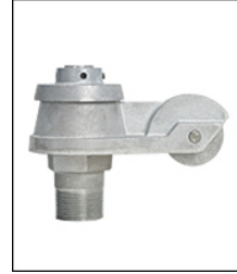
TRK-9420SS-58 HD Rev. Sealed Truck SS Spindle