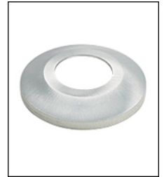
COL1-A10C FC-11 Cast Alum 1-Piece