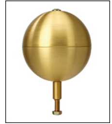
BAL-1258-GLD HD Gold Anodized Aluminum Ball