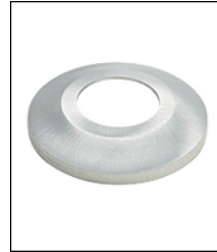
COL1-A08C FC-11 Cast Alum 1-Piece