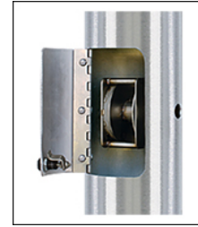
XIWW - WINCH