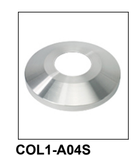
FC-11 Spun Alum 1-Piece