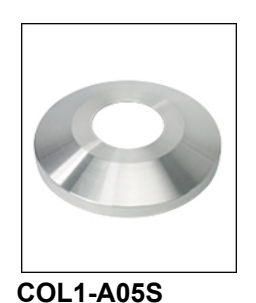
FC-11 Spun Alum 1-Piece