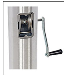
XIRW - WINCH Flush Mount Hinged Door